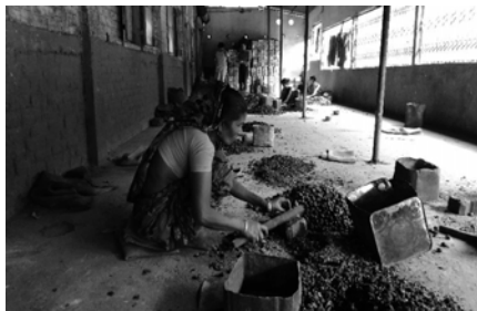
Fig. 3a. Posture of the subject while shelling

is associated with the shelling task in the cashew nut processing industries. The outcome of the assessment tools recommends further investigation of the case. Implementing the change to reduce the risk of occupational health and safety of the women workers engaged in the cashew nut processing industries of North-East region of India is eminent. The study revealed that the women workers do not have any knowledge of correct body posture, health and hygiene, musculoskeletal disorders, and consequences of prevalent risk factors. Moreover, the workplace