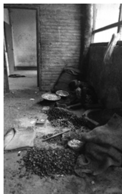
Fig. 3b. Working area of shelling