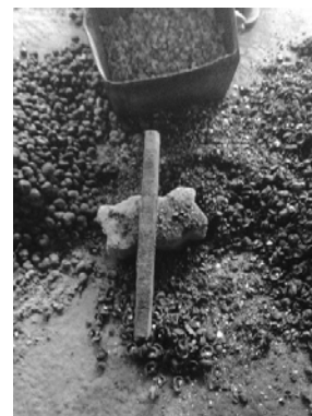
Fig. 3c. Tool used by the workers for shelling